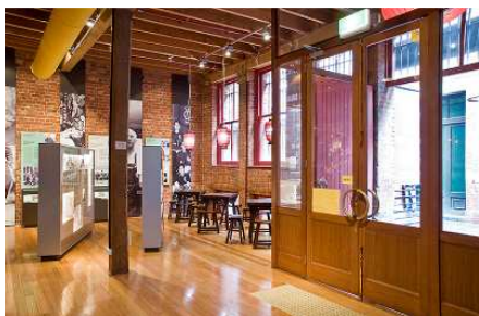
A CHINATOWN VISITOR CENTRE

In 2010 the Chinese Museum undertook major renovations to improve its facilities to enhance your school visits.