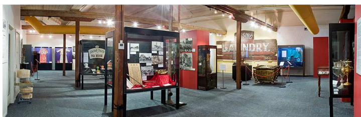
LEVEL THREE GALLERY

With a guided tour of the Museum over three floors, students will experience the trials and tribulations of Chinese gold seekers in the 1850s and progress through to the stories of Chinese Australians in our contemporary society over 160 years.