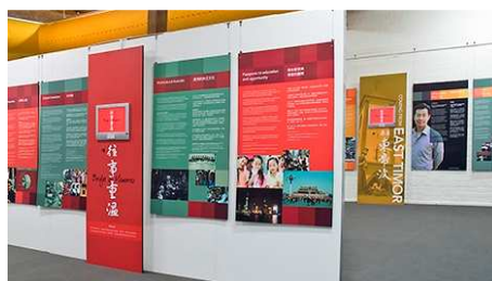
BRIDGE OF MEMORIES EXHIBITION

We are now AIR CONDITIONED THROUGHOUT and have NEW WASH ROOM AMENITIES!